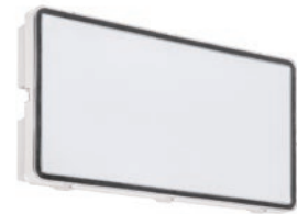
With Opal pad (FTL -PAD-OPAL)